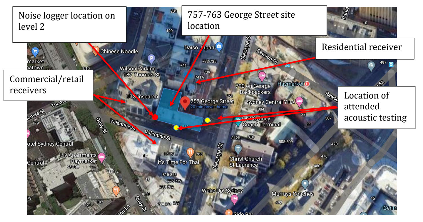
Figure 1 – 757-763 George Street Site Location

The site location is detailed in Figure 1 below.